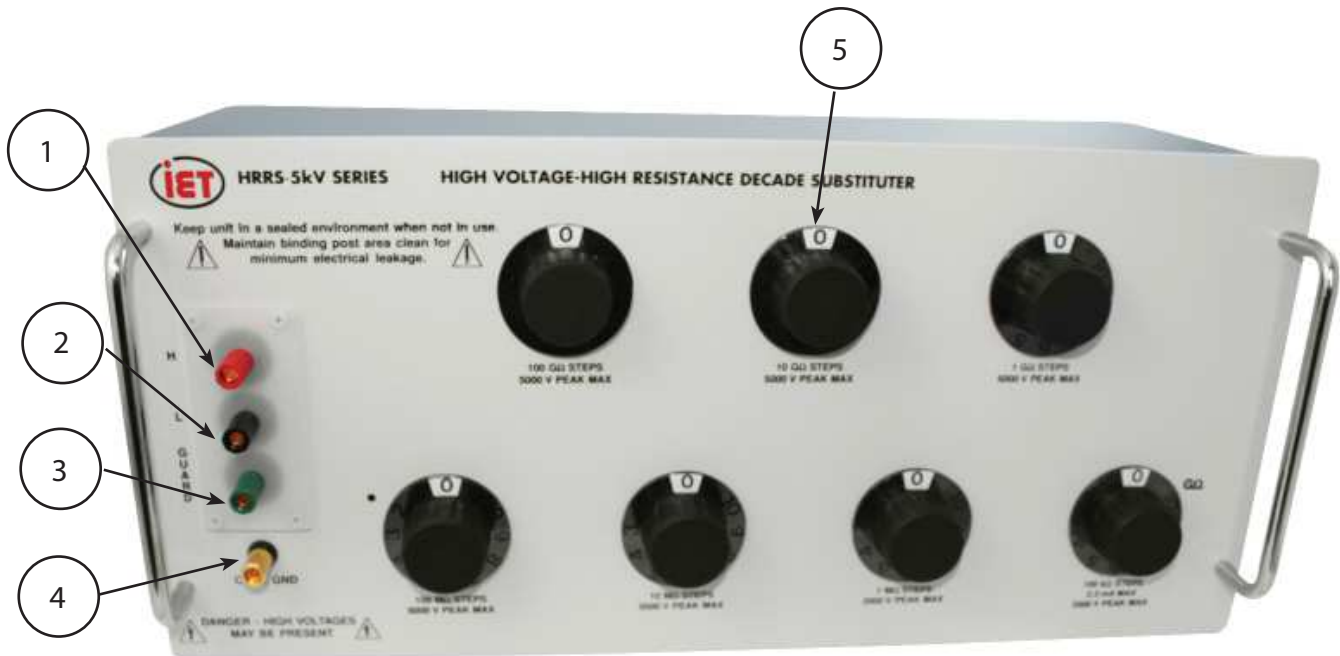
Figure 4-2: Replaceable Parts