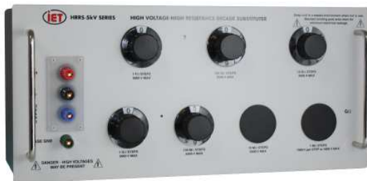
Figure 1-1: Example of an HRRS-5kV unit with 7 decades

The HRRS 5kV and 10kV series complement the HARS series which provides resistance steps as low as 1\text{ m}\Omega . The units may be rack-mounted to serve as components in measurement and control systems.