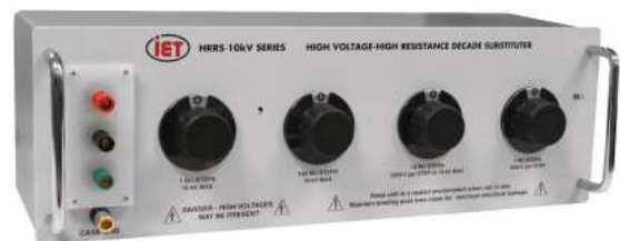
Figure 1-2: Example of an HRRS-10kV unit with 4 decades