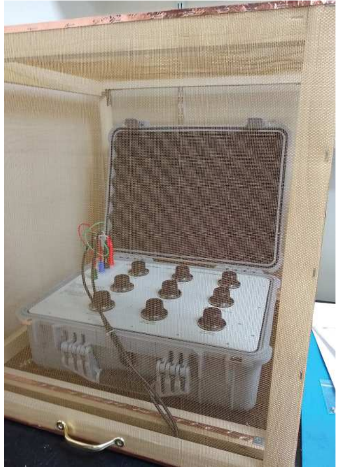
Figure 3-1: HRRS-WT in faraday enclosure

If this instrument is to be stored for any lengthy period of time, it should be sealed in plastic and stored in a dry location. It should not be subjected to temperature extremes beyond the specifications. Extended exposure to such temperatures can result in an irreversible change in resistance, and require recalibration.