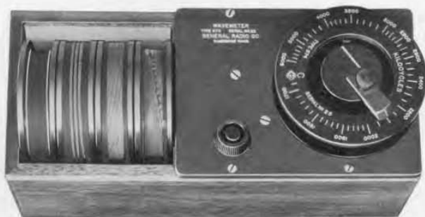
TYPE 574 Wavemeter

M ANY uses may be found for a simple direct-reading wavemeter covering a wide range of frequency. The new TYPE 574 Wavemeter, which is calibrated in terms of frequency and which has a nominal precision of 1%, is valuable as a general-purpose instrument and also for obtaining rapid