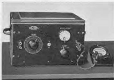
TYPE 514-A Amplifier and a TYPE 588-DM Alternating-Current Voltmeter

If used with a common indicating device which will respond at super-audible frequencies, the amplifier offers a null detector for bridge circuits operating at frequencies as high as 100 kc. Throughout a good deal of the audible range, the sensitivity is equivalent to that possible with standard telephones applied directly to the bridge, since telephone and ear sensitivity fall very rapidly as the frequency departs from 1000 cps. The sensitivity when using the oxide meter and amplifier is somewhat less than that obtained with the best direct-current wall galvanometers, but is comparable to that obtained with the less expensive direct-current galvanometers. The high input impedance of the amplifier is a distinct advantage in high-impedance bridges. If, instead of a meter, telephones are used on the output of the amplifier, a far greater bridge sensitivity is available at 1000 cps. than can be obtained